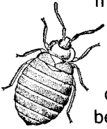
Female Bed Bug

Bed bugs are often unknowingly transported to new locations, but they can also independently crawl off by themselves from room to room and apartment to apartment. It is believed that they prefer to remain in the same area, close to each other and where they can get a blood meal—unless they become overcrowded or their food source disappears.